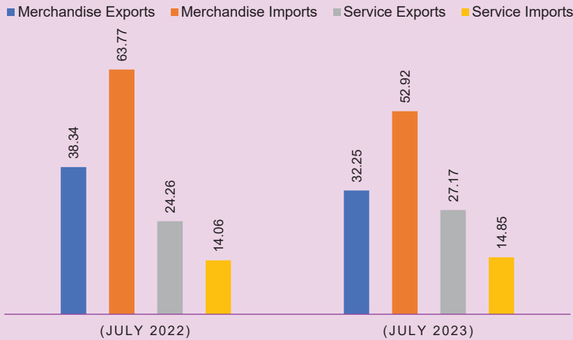
FIGURE: Comparative column chart representation of the exports and imports for the July 2022 and July 2023. (Source Union Ministry for Commerce and Industries). The latest data for services sector released by RBI is for June 2023. The data for July 2023 is an estimation, which

CONTEXT: India's overall exports (Merchandise and Services combined) in July 2023 is estimated to be USD 59.43 Billion, exhibiting a negative growth of -5.06 per cent over July 2022. Overall imports in July 2023* is estimated to be USD 67.77 Billion, exhibiting a negative growth of (-) 12.92 per cent over July 2022.