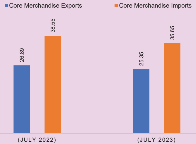
FIGURE: Comparative column chart representation of the core merchandise exports and imports for the July 2022 and July 2023. Core merchandise excludes petroleum, gems & Jewellery including gold, silver & pearls, precious & semi-precious stones.

will be revised based on RBI's subsequent release. (ii) Data for April-July 2022 has been revised on pro-rata basis using quarterly balance of payments data.