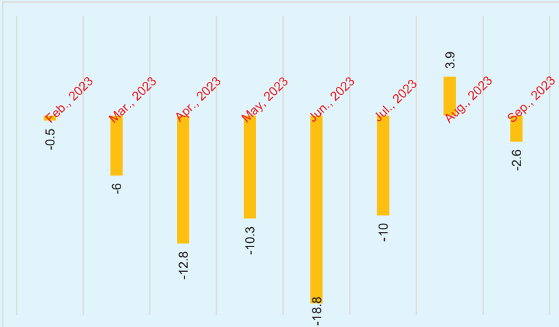
FIGURE: Column chart representation of Year on Year (Y-o-Y)merchandise export growth rates.