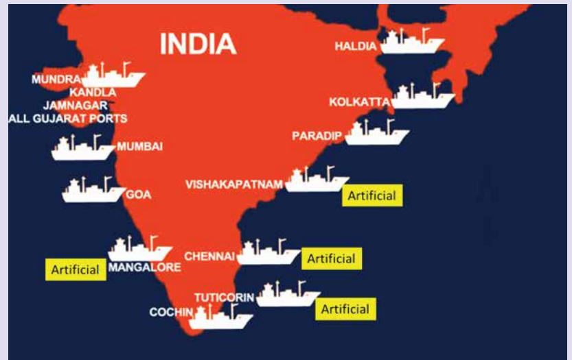
FIGURE: Map of the Major Ports of India.

CONTEXT: Prime Minister Narendra Modi unveiled the 'Amrit Kaal Vision 2047', a long-term blueprint for the Indian maritime blue economy, while inaugurating Global Maritime India Summit 2023 in Mumbai through video conference.